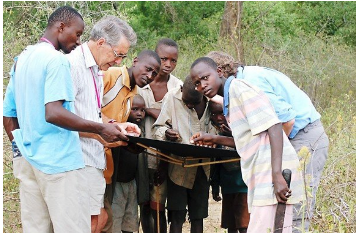
Fig. 3. Work with the beating tray. Sharp-eyed locals give their assistance!

important for its own sake, but since Acacia woodlands often abut agricultural areas or are 'manicured' as gardens (e.g. around Lake Naivasha), knowledge of life histories can indicate when a species' primary host plant may be a wild tree rather than a cultivated legume. This woodland biotope is threatened by increasing population pressure with the associated demand for firewood, and so an appreciation of its biodiversity potential is important, before it is too late.