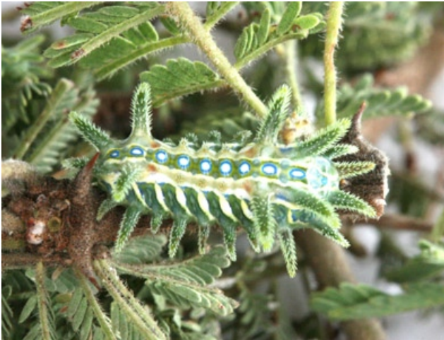
Fig. 2. Coenobasis farouki (Limacodidae).